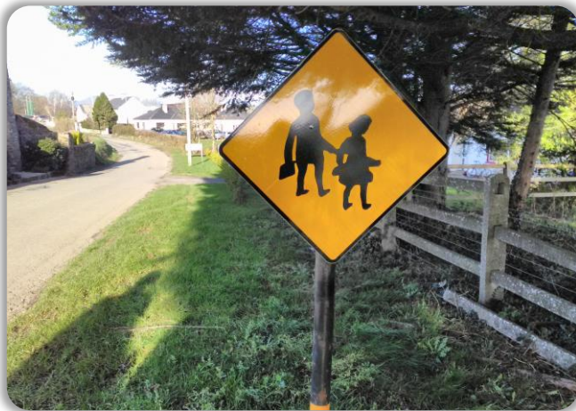
There was signage on approach to school from the church