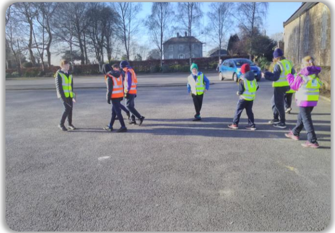
There is ample parking at the church