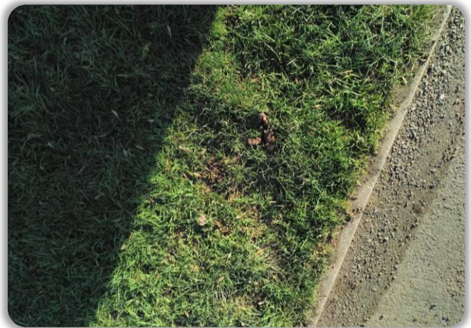
Dog fouling present on the grass verge