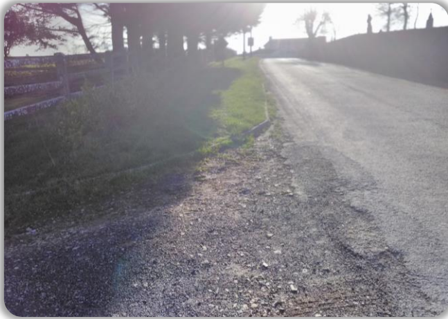
There is a wide grass verge on part of the route to the church